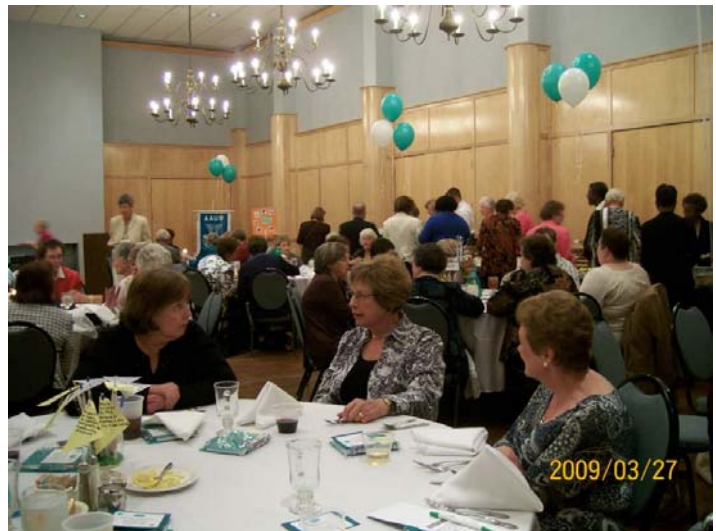
AAUW NC Convention 2009: Wilmington branch members enjoying lunch